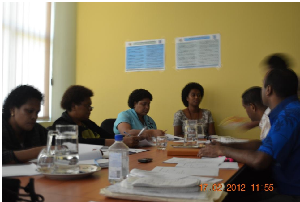
ICH Inter-agency meeting at the Institute of ITaukei Language & Culture