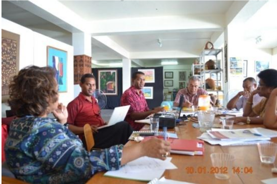
Fiji Arts Council Board discussing on IP issues