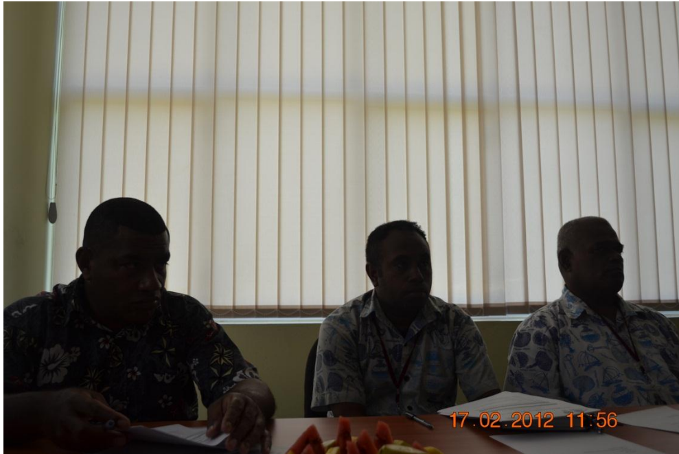
Officers from the Department of National Heritage Culture & Arts in discussion with Officers from the Institute of iTaukei Language & Culture