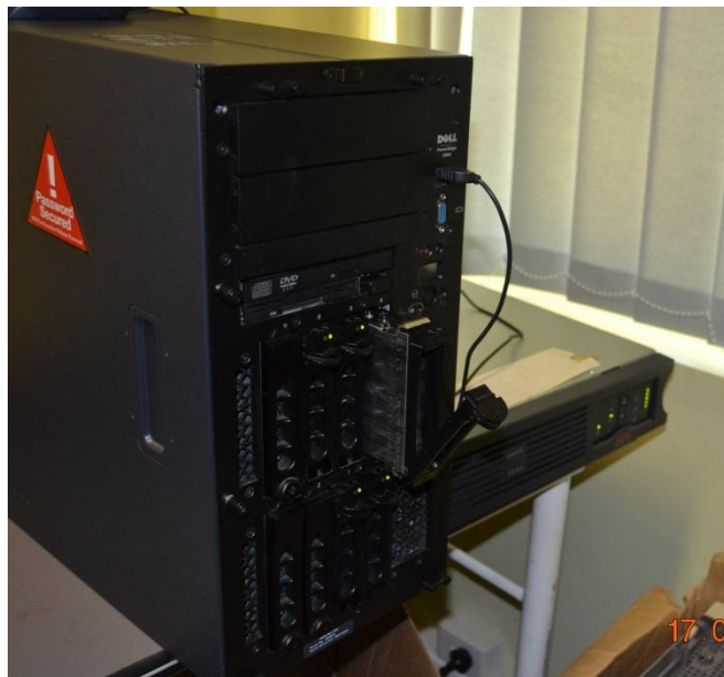
The Institute of iTaukei Language & Cultures server at the Ministry of iTaukei Affairs.