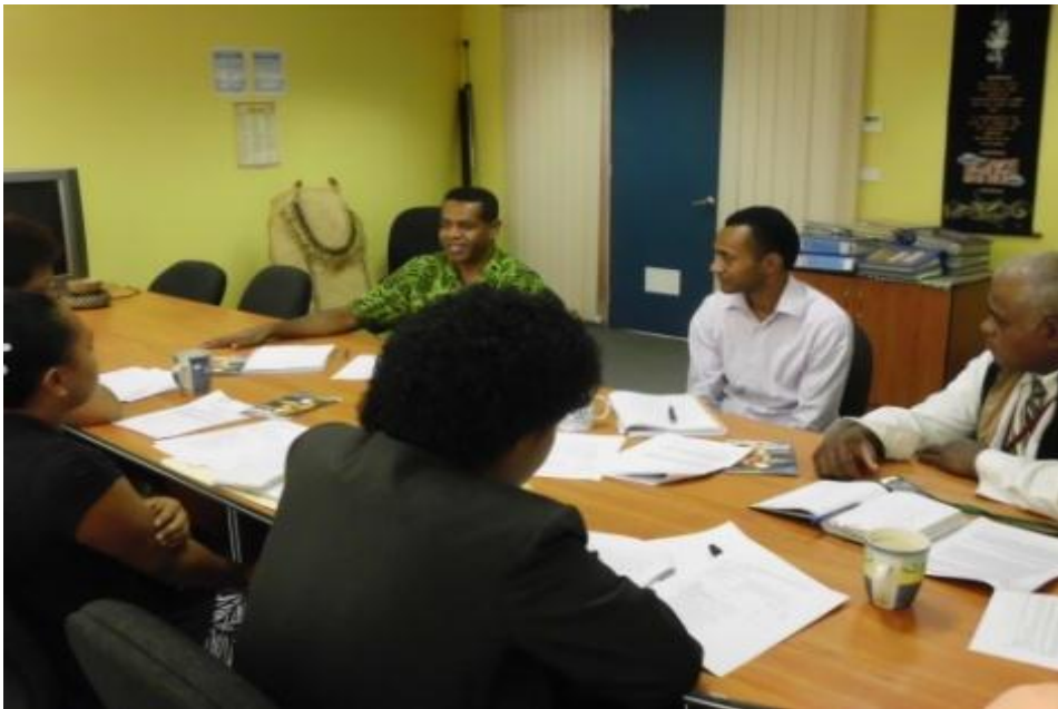
Discussions with iTaukei Affairs on IP Project