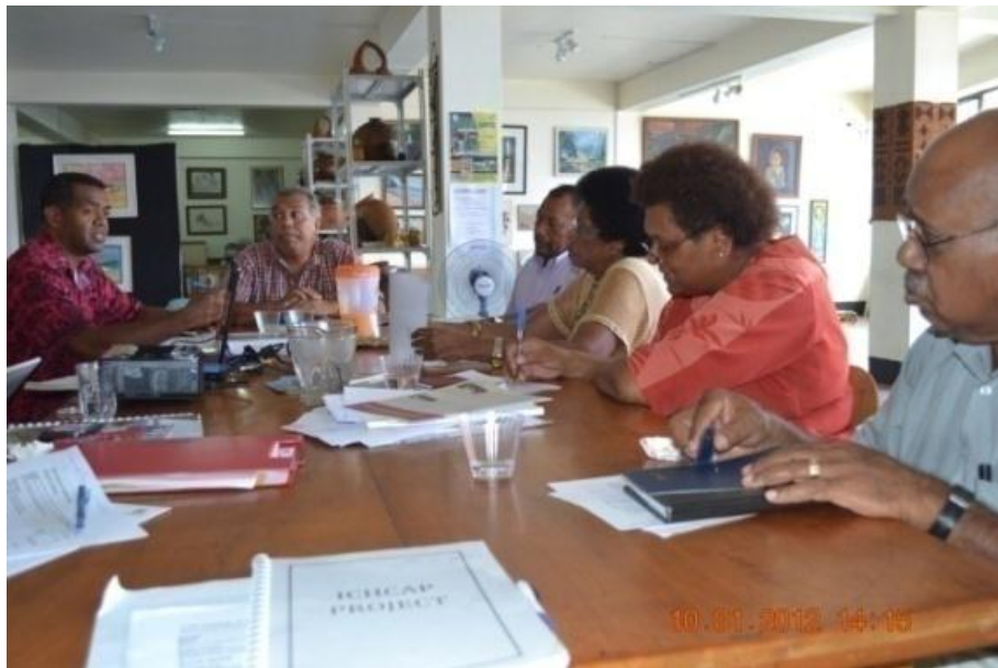
Discussions with FAC Board on IP Project status