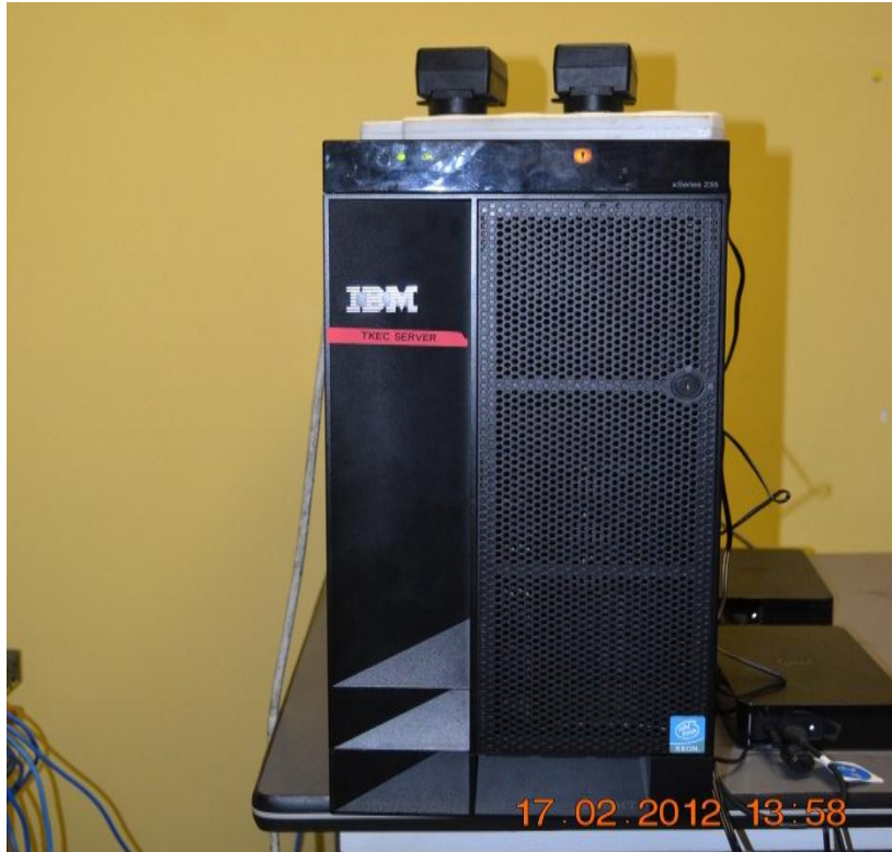
Part of the Server at the Ministry of iTaukei Affairs

The Ministry of iTaukei Affairs Institute of iTaukei Language and Culture experiences database problems with old obsolete equipment and software for the Inventory for Cultural Mapping. Above are pictures of the Server Room equipment taken at the Ministry of iTaukei Affairs.