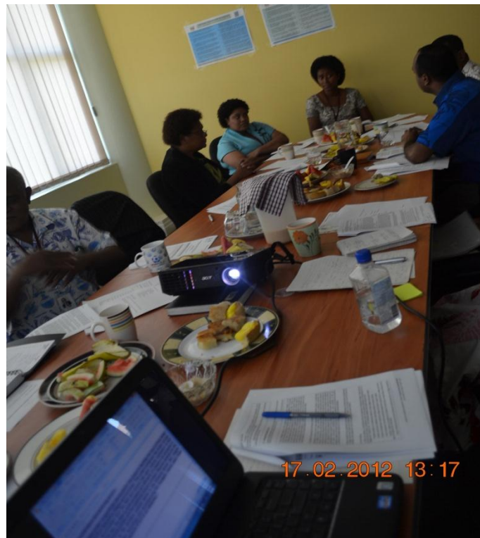
Discussions on IPR and Best Practices Nomination in Progress